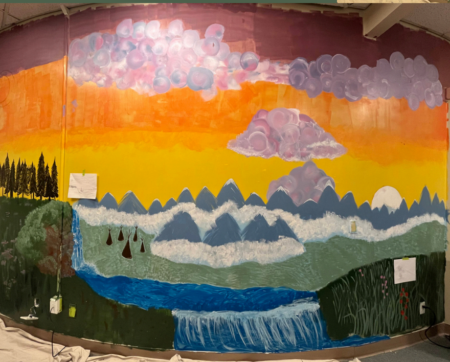
“Close to the End” Phase